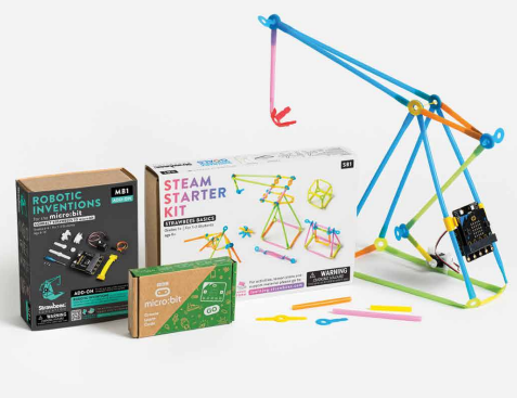
STEAM Starter with micro:bit - bundle

>>suitable for classroom line-up > 30 students