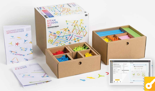
STEAM School Kit

>>suitable for classroom line-up > 30 students