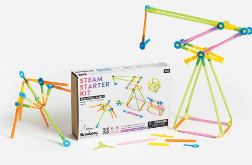
STEAM Starter Kit

>>suitable for classroom line-up > 30 students