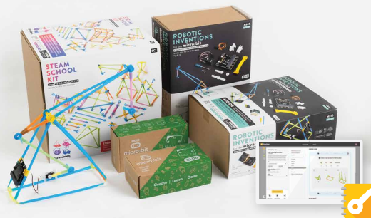
STEAM Classroom with micro:bit - bundle

>>suitable for classroom line-up > 30 students